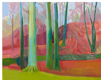
Beech Forest: oil on canvas 80x100cm. © Pamela Willoughby 1995. All rights reserved.

Willoughby's art transitioned from a mood of dark brooding to one of bright optimism. This echoed the changes in her life as appreciation of the freedom and beauty of nature helped her overcome her struggles with polio and an oppressive father. Every brush stroke was her expression of that freedom and a testament to her indestructible will to fight for life and to succeed.