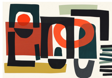
Sagovir: screenprint 30x42cm.

Laurie Lee's vivid description of people and place is the inspiration for the sixth literary themed exhibition from Bodenpress. Twelve artists interpret Lee's written word through diverse printmaking techniques, both traditional and modern. The artists will be available throughout the show to discuss their work and promote the practice of printmaking to a wider audience.