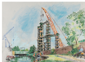
Reinstalling Gasholder 8, near St Pancras Lock: mixed media 44x60cm. Marianne Fox Ockinga © 2013. All rights reserved.

Piles of scaffolding...and giant forms of cranes...In short, the yet unfinished and unopened Railroad was in progress. [Dickens: Dombey & Son] From 2000 the area of King's Cross St Pancras was in turmoil once again, this time for the construction of the Channel Tunnel Rail Link terminal. When Fox Ockinga happened to see a segment of the gasholders being lifted she decided to record, in drawings and prints, as many of the enormous changes as she could in the years that followed.