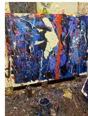
New York New York: oil on canvas 157x193cm. © Philip Diggle 2023. All rights reserved.

The expressionist tendency in art is one which stylises and schematises in the manner of primitive art at the expense of tonal particularity; it declares the physicality of paint; it exploits archaic associations, and frequently addresses sensually provocative content. All these elements are manifest characteristics of art which interest Diggle. A powerful exhibition of new work by this acclaimed Highgate artist.