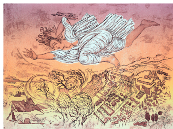
Demeter and Persephone - Enraged Goddesses: stitching with viscosity relief, 38x46cm. © Rosalind Whitman 2021. All rights reserved.

Artist Printmaker Rosalind Whitman draws inspiration from myths, literature and story-telling. Her show will feature works across a range of media created in response to three themes in particular: the Greek mother and daughter goddesses Demeter and Persephone; Emily Bronte's novel, 'Wuthering Heights'; and images referencing the fascinating subject of Alchemical Transformation.