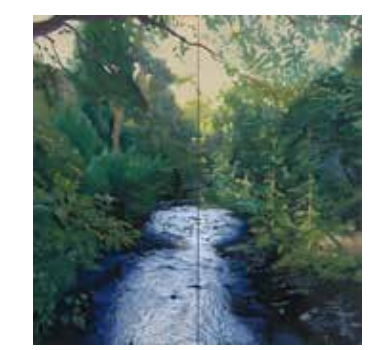
Spirit of the Valley: detail, oil on panel 92x92cms.

Lecture and related events: www.hlsi.net/highgate-gallery