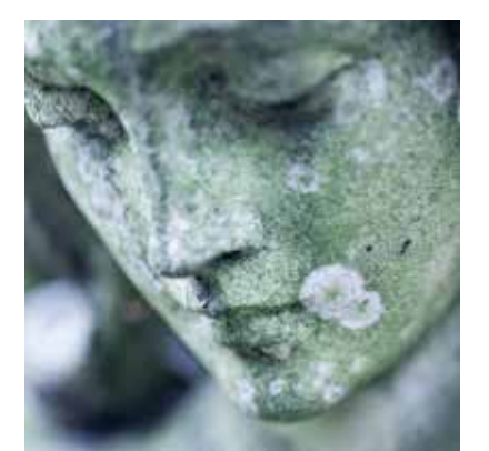
Lecture and related events: www.hlsi.net/ highgate-gallery

Thirteen artists from UK, India, Peru, South Africa and Spain, all trained in portraiture, bring different personal and cultural perspectives on death and commemoration to this exhibition. Letting their imaginations roam in the famous Highgate Cemetery, a short distance from the Gallery itself, they examine mortality, immortality and visibility, the march of time and the inevitability of our demise, sometimes reviving posthumous residents of the cemetery in imaginary dimensions.