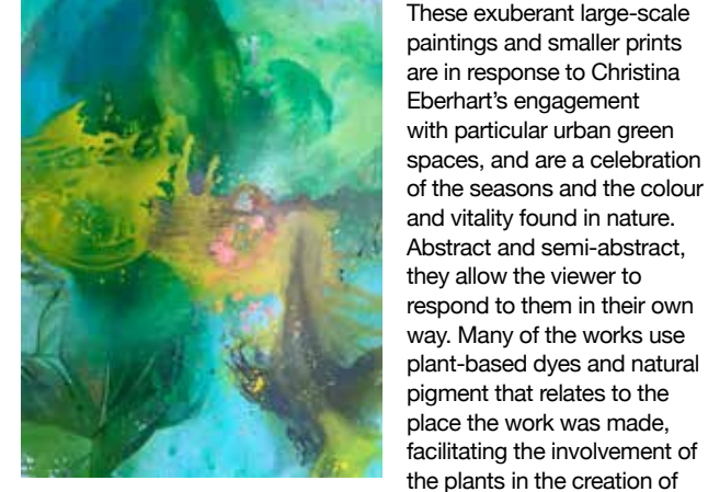
Acrylic on canvas 120x92 cms. © Christina Eberhard 2021 All rights reserved.